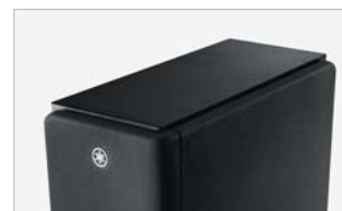
L-shape design with fabric and plastic combination