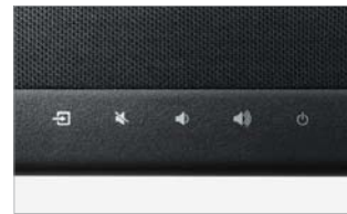
Touch-type operating buttons