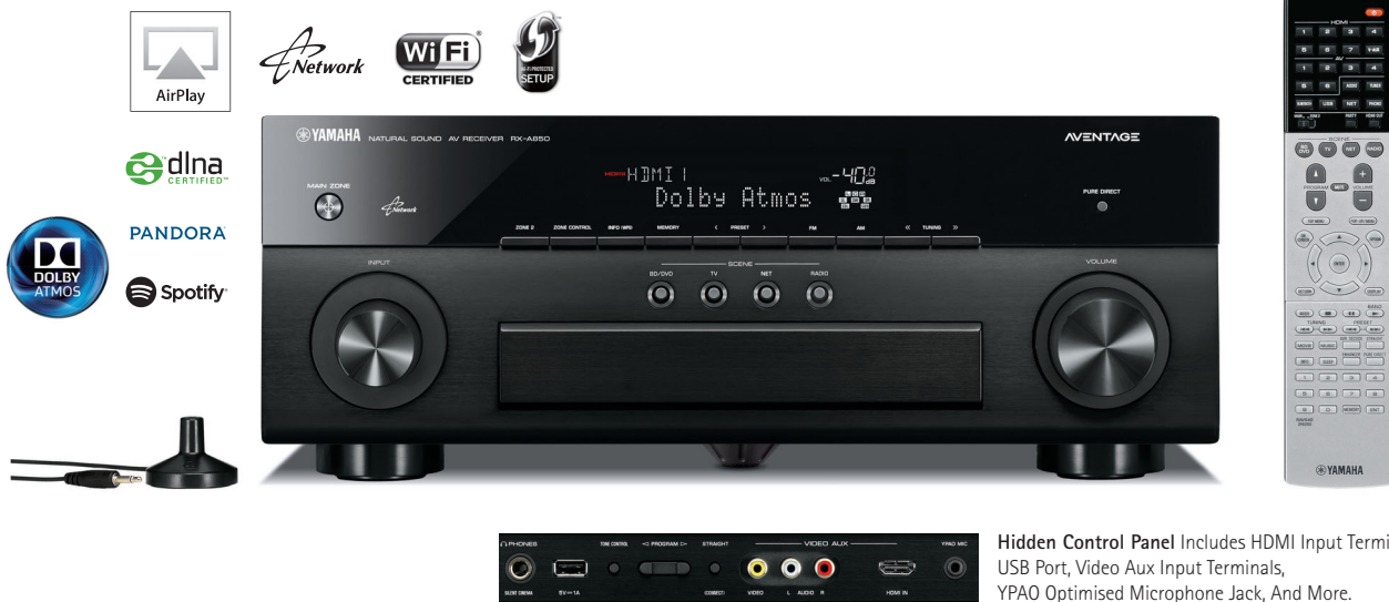
Hidden Control Panel Includes HDMI Input Terminal, USB Port, Video Aux Input Terminals, YPAO Optimised Microphone Jack, And More.

AVENTAGE Network AV Receiver with Dolby Atmos® compatibility for genuine 3D surround sound in your own home. Also featuring High Resolution audio playback support, 4K Ultra HD full support, Wi-Fi and Bluetooth ® Built-in, and audiophile design for detailed audio reproduction.