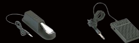
Foot Switch FC4