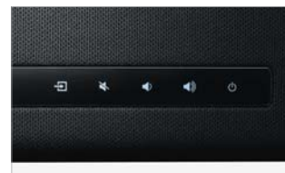
Touch-type operating buttons