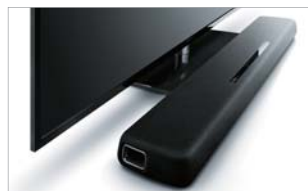
Low-profile design never obstructs view of TV